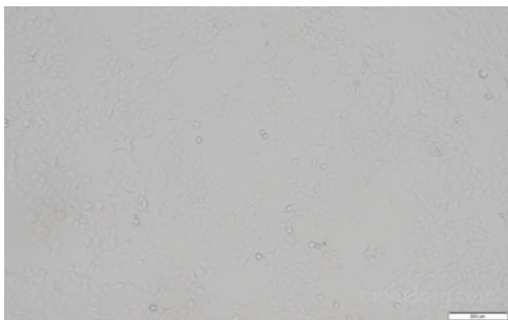
Fig1. Morphology of MCF7 cell line.