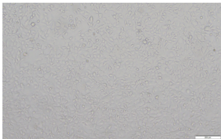
Fig1. Morphology of EBC-1 cell line.